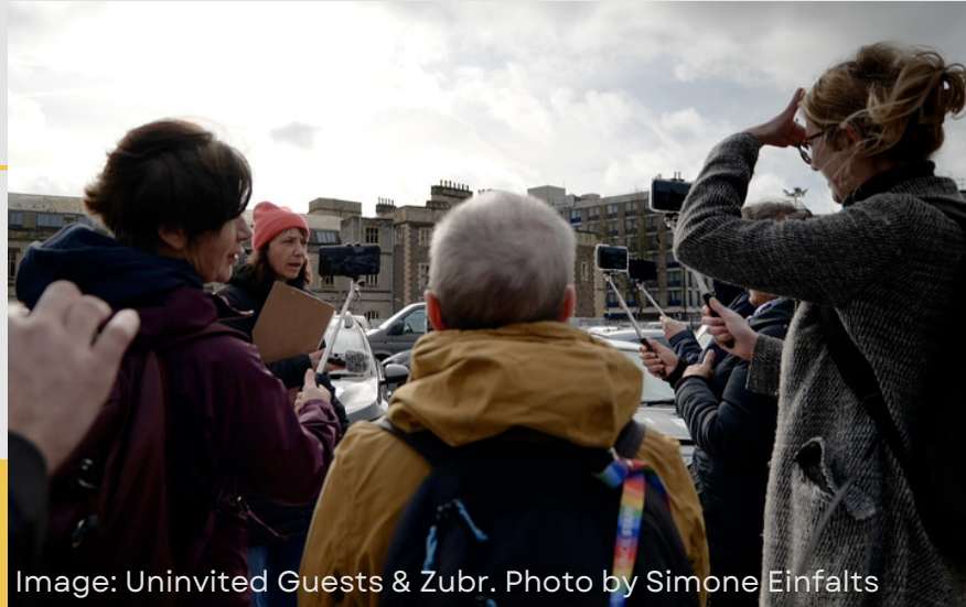
Image: Uninvited Guests & Zubr.